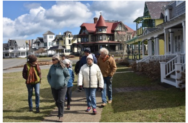
Enjoying the sites of Oak Bluffs in March

The VTA bus #2 leaves the Steamship at 1:27 and will stop on request at Polly Hill, State Road, West Tisbury.