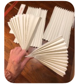
Judi folds in half