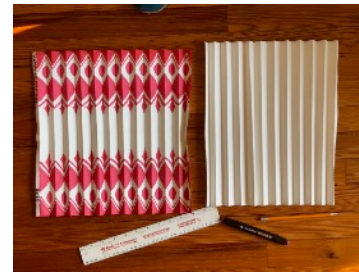
Decorating the fan