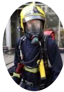
A Scott Air pack