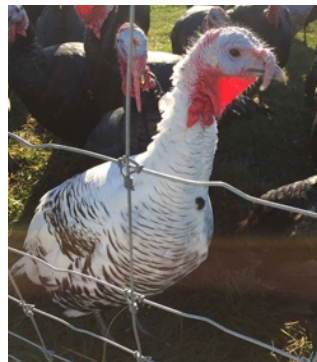
The turkey that visited from the Farm Institute

On a Monday afternoon we had a guest appearance at Windemere. A turkey from the Farm Institute came for a visit. It had a white and red head with brown on him. Everybody enjoyed seeing it. The visitor who brought the turkey also brought an interesting skull bone and some beautiful fall leaves and acorns in a basket.