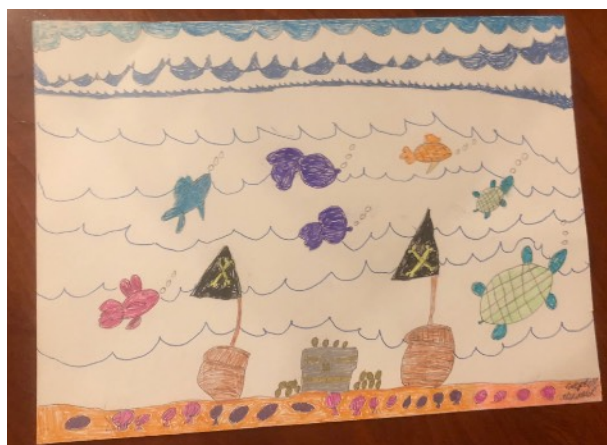
Alexander's underwater scene